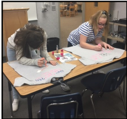
Horizon Middle School

Activities done by students range from, photo booths, decorating t-shirts, creating large displays, and even peer to peer presentations. In North Dakota 11.7% of youth smoke commercial tobacco. According to Campaign for Tobacco Free Kids, 14,000 kids now under the age of 18 will ultimately die prematurely from smoking. This year the following schools participated in Great American Smokeout: Horizon Middle School, Simle Middle School, Legacy High School, Century High School, Light of Christ 7 th and 8 th Grade Academy, and St. Mary's High School.