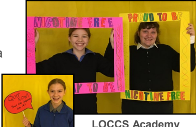
LOCCS Academy SADD Chapter

Every year, on the third Thursday of November marks the annual Great American Smokeout. While the event is aimed at encouraging smokers to make a plan to quit, youth in Bismarck use the day to educate their peers about the dangers of tobacco use in hopes to prevent their peers from starting.