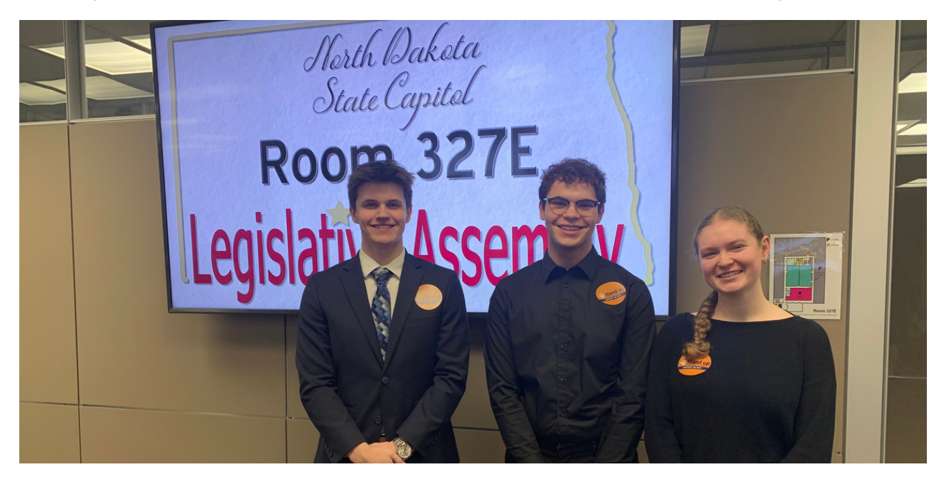
Bismarck Break Free Youth Board Members Providing Testimony.

Thank you to the House Representatives who stood tall and voted Yay!