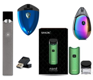
High tech and sleek vaping devices