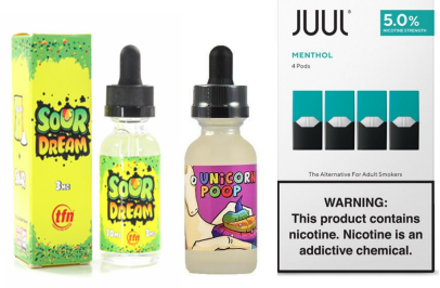
15,000+ flavored e-juices & Menthol flavored pods